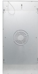
Surface Mount Bracket Included